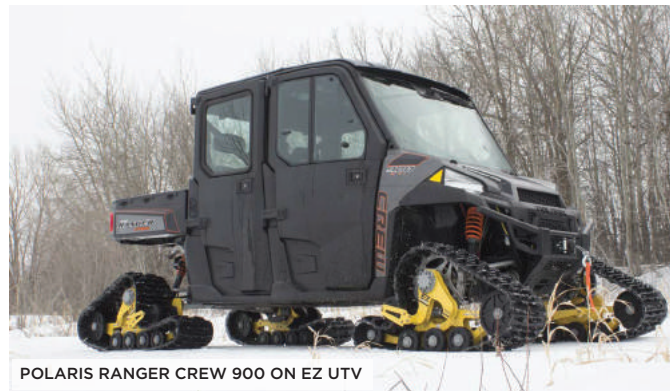
POLARIS RANGER CREW 900 ON EZ UTV