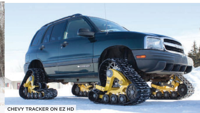
CHEVY TRACKER ON EZ HD

ALL SPECIFICATIONS ARE APPROXIMATE AND WE RESERVE THE RIGHT TO MAKE CHANGES OR MODIFICATIONS WITHOUT NOTIFICATION